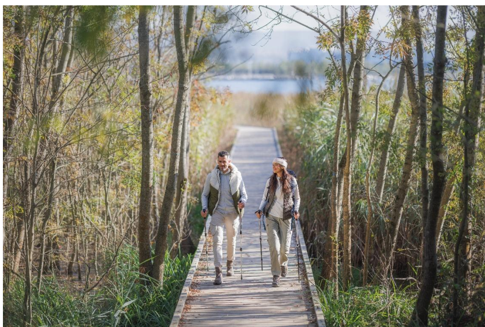
Recreational green areas – Across the Salt Meadow