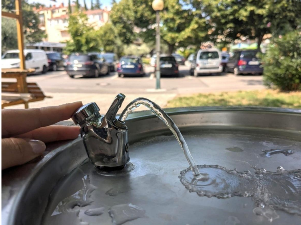
Drinking fountain in the centre of Ankara