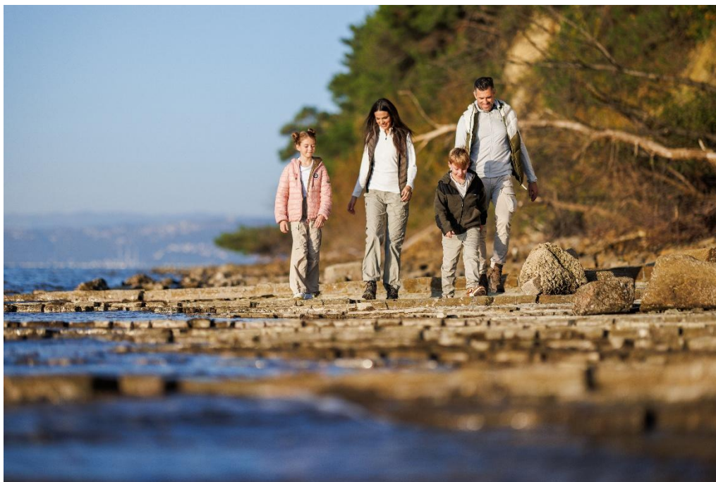
Debeli rtič Landscape Park